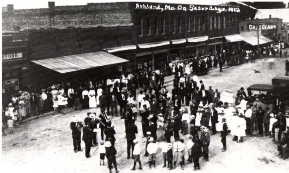
BROADWAY STREET SCENE SATURDAY, 1912